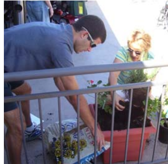
San Diego Downtown Breakfast Rotary "beautifies" the rooftop terrace at Potiker Family Senior Residence.

You can decorate placemats and prepare tray favors for seniors in our HDM program or fill laundry baskets with soap, towels and pillows for THP clients or organize activities for seniors at one of our two affordable supportive housing complexes.