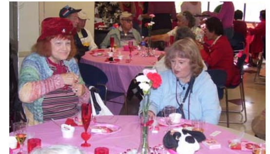
The seniors at the Broadway Center enjoy the festive decorations and sweet treats provided by National Charity League—San Diego chapter for their annual Valentines Day party.